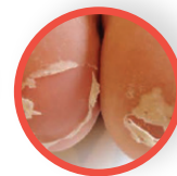
Within 1 week